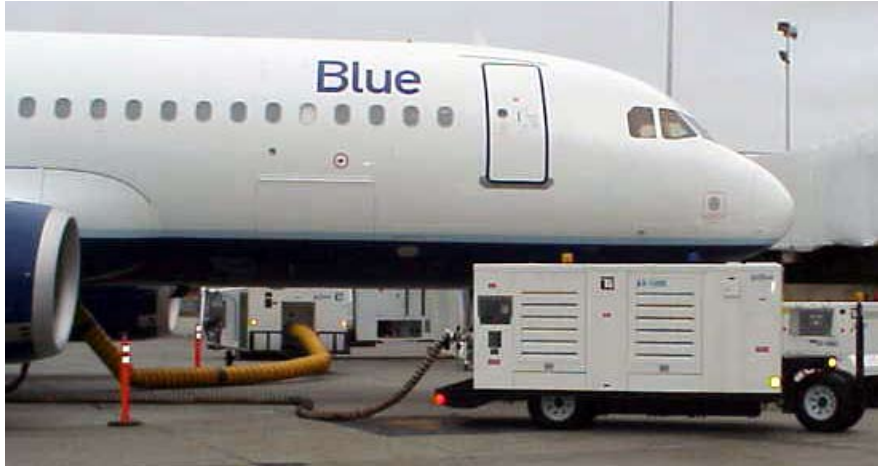
Model ASP250 Trailer Mounted